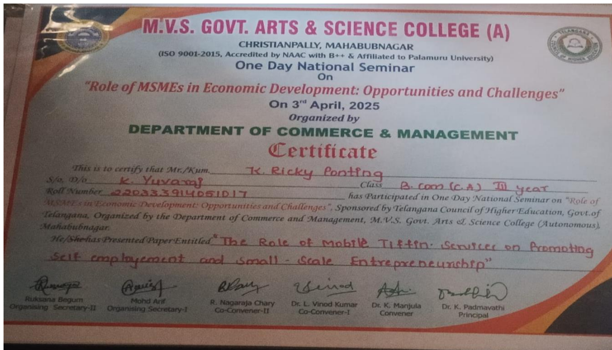
PHOTO: CERTIFICATE RECEIVED BY RICKY PONTING