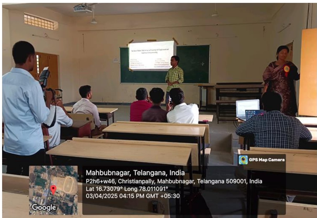
Photo: Ricky Ponting giving Seminar presentation.